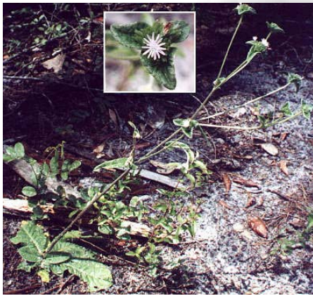
Tall Elephant's Foot