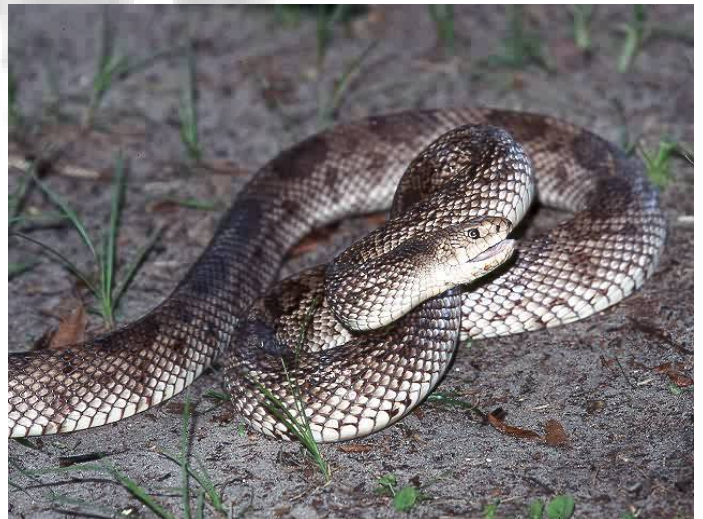
FL Pine Snake