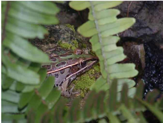
Leopard Frog