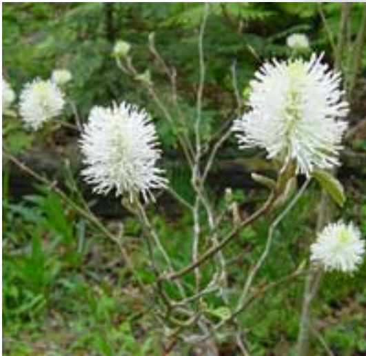
Witch Alder Bloom