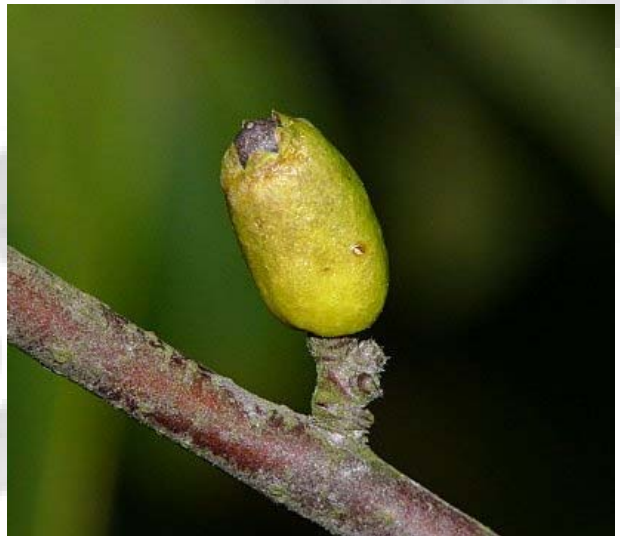
Horse Sugar Fruit

The Sky Tells a Story: Galileoscope, good starter scope for kids only $20