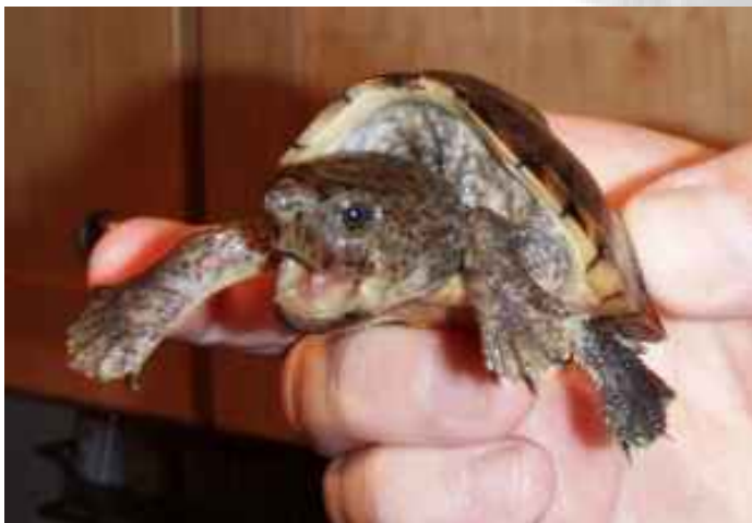
Loggerhead Musk Turtle

http://entnemdept.ifas.ufl.edu/creatures/beneficial/cicada_killers.htm