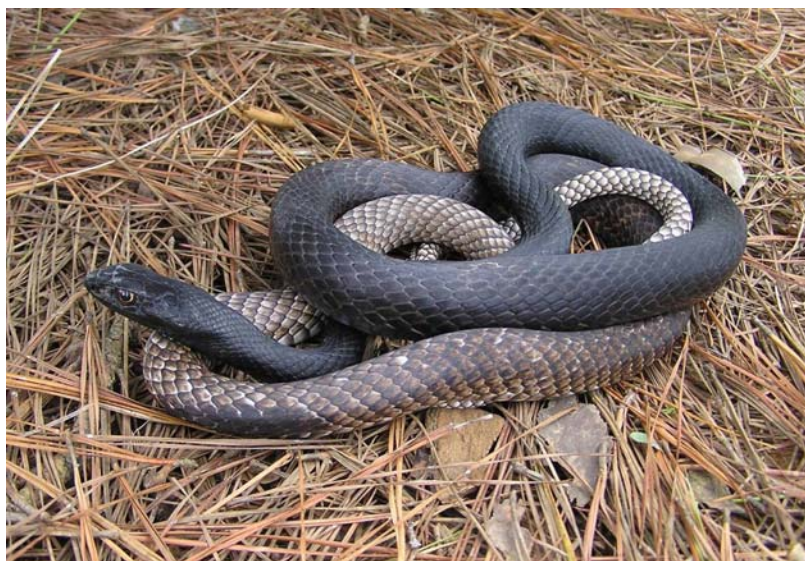
E. Coachwhip (can be found at STSR)