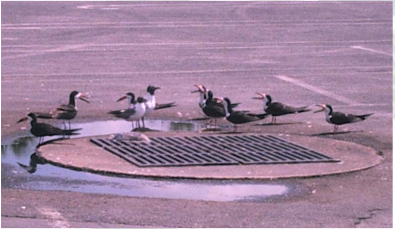
Black Skimmers at PC Mall