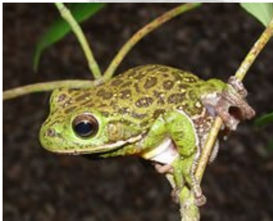
Barking Tree Frog