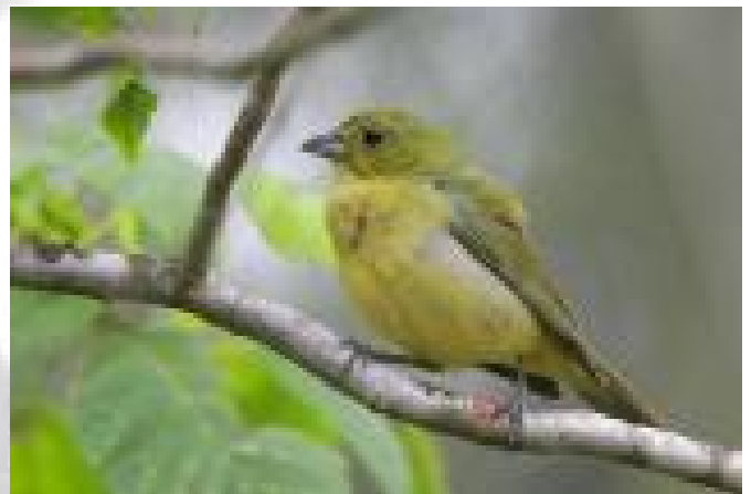
Painted Bunting Female