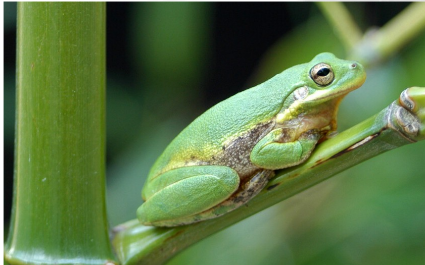
Squirrel Tree Frog

The Sky Tells a Story: Venus dominates the evening sky for the next six months. Mars is rising in the NE in Leo about midnight. Jupiter is still well placed in the southern sky through March of 2012. Saturn rises about midnight near Spica in Virgo.