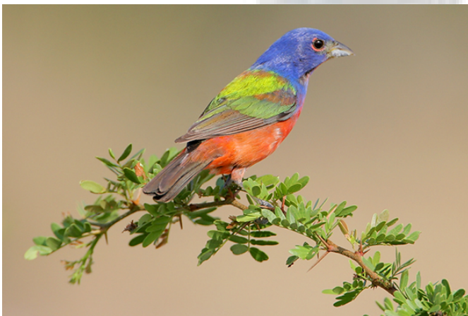
Painted Bunting Male

http://ohioline.osu.edu/hyg-fact/pdf/FS_3824_08.pdf