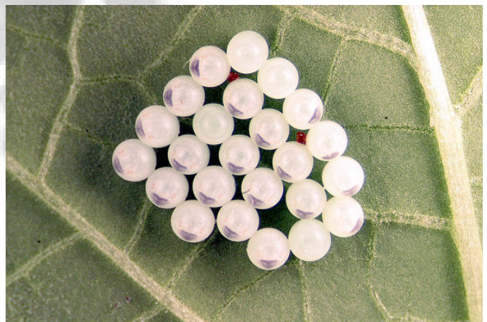
Brown Marmorated Stink Bug and Egg Cluster

Critter of the Month: Squirrel Tree Frog , Hyla squirella ,