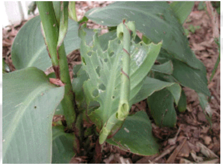
damage caused by canna leaf roller

Critter of the Month: Yellow-bellied Slider , Trachemys scripta scripta http://plants.ifas.ufl.edu/guide/turtles.html