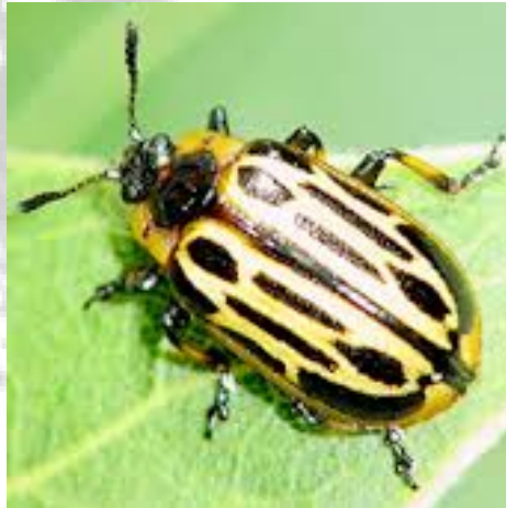
Cottonwood Leaf Beetle