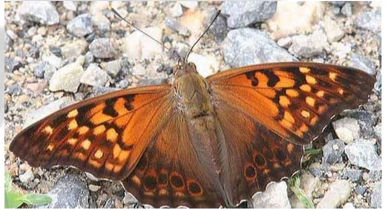
Tawny Emperor Butterfly

Critters of the Month: Chicken Turtle, Deirochelys reticularia http://srelherp.uga.edu/turtles/deiret.htm