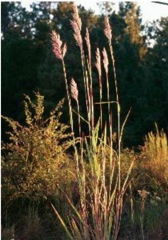
Sugarcane Plume Grass

Critters of the Month: Chicken Turtle, Deirochelys reticularia http://srelherp.uga.edu/turtles/deiret.htm