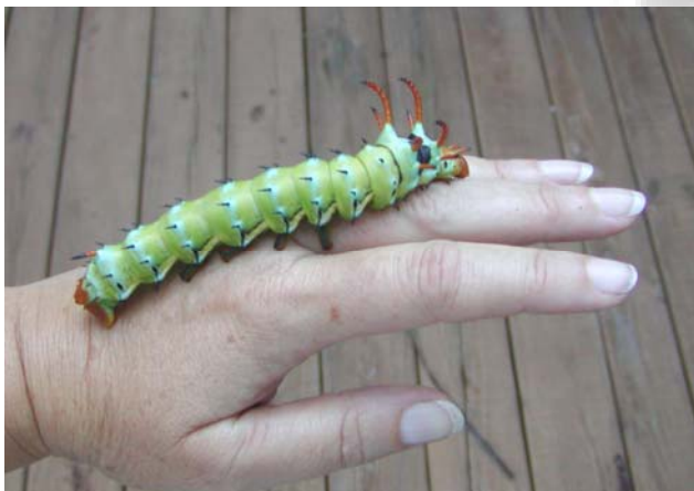
Hickory Horned Devil