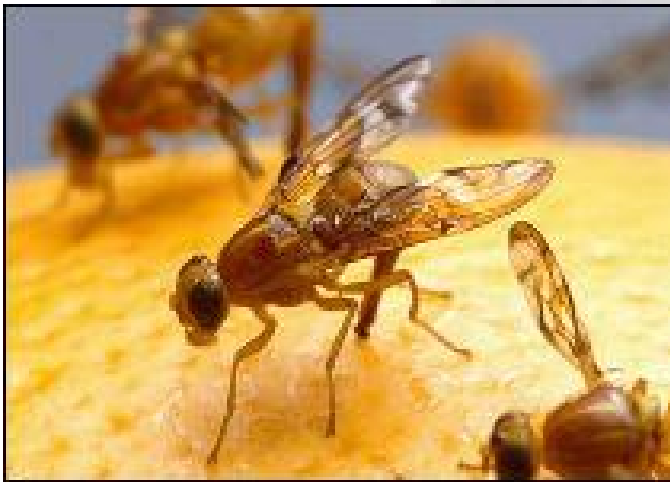
Mexican Fruit Fly