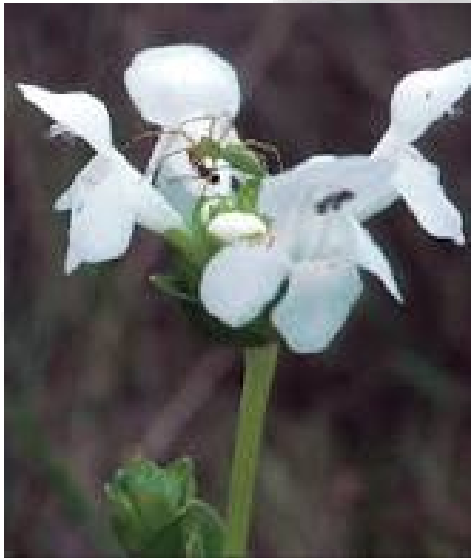
White Birds-in-a Nest

Critter of the Month: Spadefoot Toad , Scaphiopus holbrooki http://www.wec.ufl.edu/extension/wildlife_info/frogstoads/scaphiopus_holbrooki_holbrooki.php and Swamp Daddy , Halfmanus halfamazingei