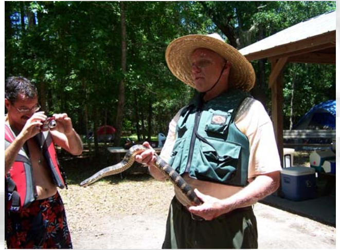
Swamp Daddy, Halfmanus halfamazingei

The Sky Tells a Story: The big event for June 2012 was the transit of Venus in front of the sun on the afternoon of Tuesday, June 5th. This rare event will not occur again in our lifetimes; it will be 127 years before the alignments of Earth and Venus again cause Venus to appear to move across the visible disk of the sun.