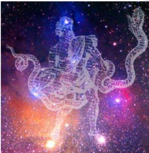
Ophiuchus, the Snake Handler

The brightest star of the northern hemisphere, Vega rises in the NE as twilight deepens. Its constellation, tiny Lyra, looks like a parallelogram just south of Vega, but was the harp of Orpheus in Greek legends.