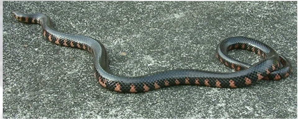
EASTERN MUD SNAKE