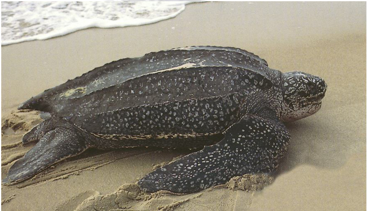
LEATHERBACK SEA TURTLE