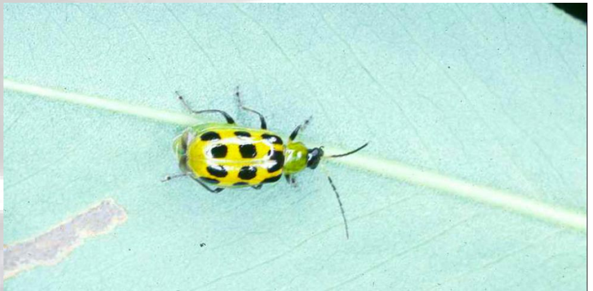
Spotted Cucumber Beetle