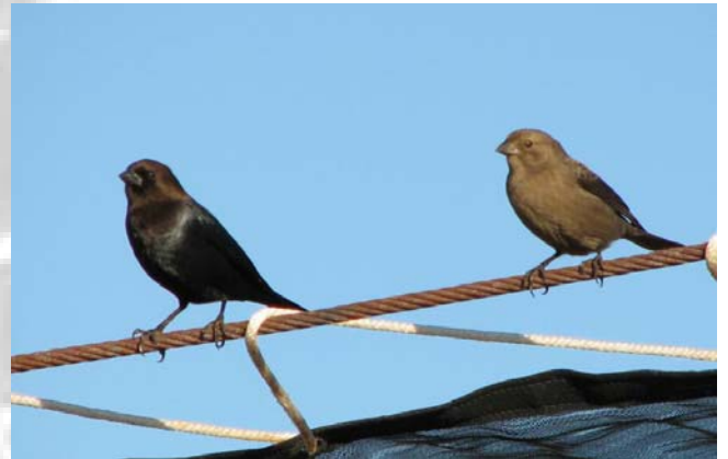
Brown-headed Cowbird Male & Female

The Sky Tells a Story: Feb 2013 Evening Sky Map