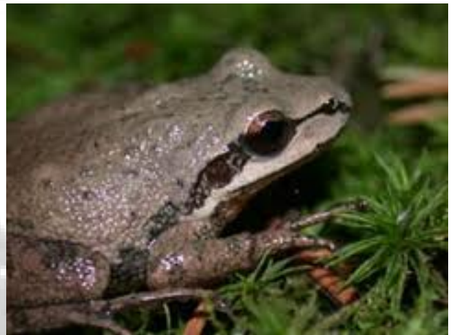
Southern Chorus Frog