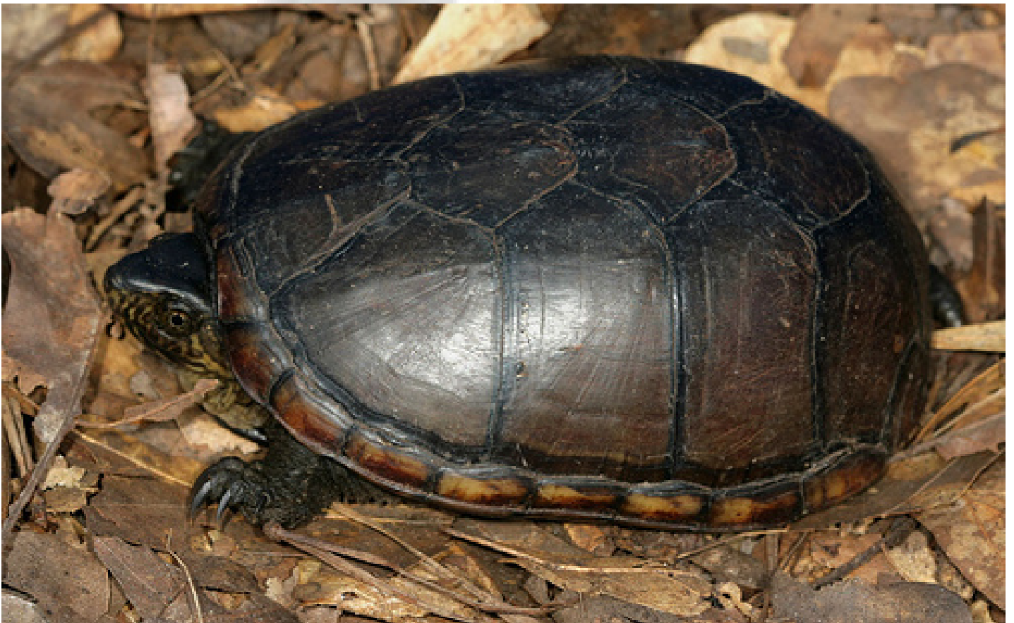
FL Mud Turtle

Everybody's Heard About the Bird: FL Sandhill Crane , Grus Canadensis pratensis http://www.fnai.org/FieldGuide/pdf/Grus_canadensis_pratensis.pdf http://www.nwf.org/Wildlife/Wildlife-Library/Birds/Sandhill-Crane.aspx