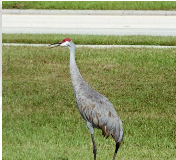
FL Sandhill Crane

The Sky Tells a Story: Cherokee Indian Legend of “ The Place where the Dog Ran ” which we know as the “ Milky Way ”. This story explains how the dazzling path of the Milky Way was made by a big dog that tried to steal precious cornmeal from a village. Most of what he stole was spilled across the sky as this bad dog made his frantic getaway from the pursuing villagers. The Place where the Dog Ran (or the Milky Way) is somewhat visible all year-round, but it is at its brightest during short summer nights.