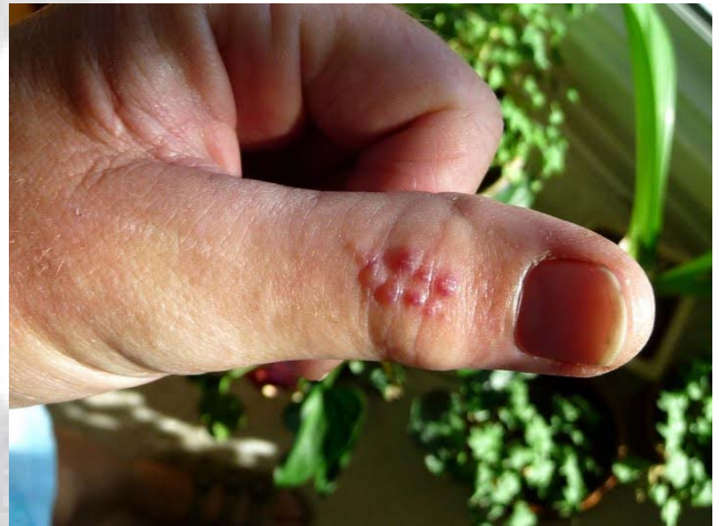
and bite from caterpillar