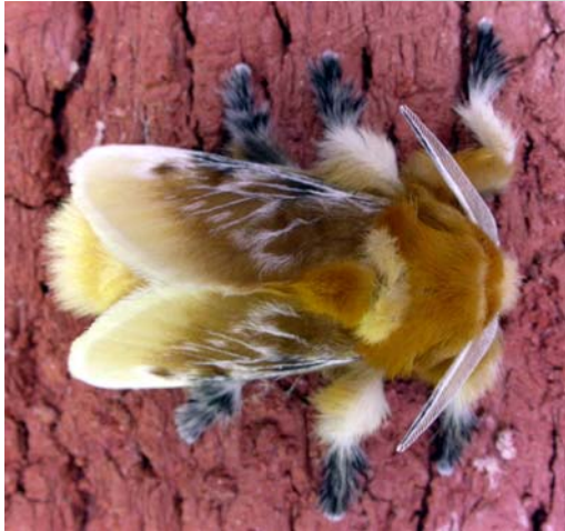
Southern Flannel Moth