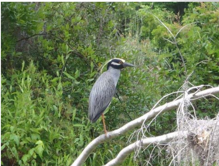
Yellow-crowned Night Heron