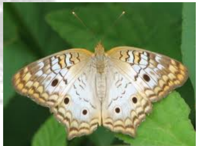
White Peacock Butterfly