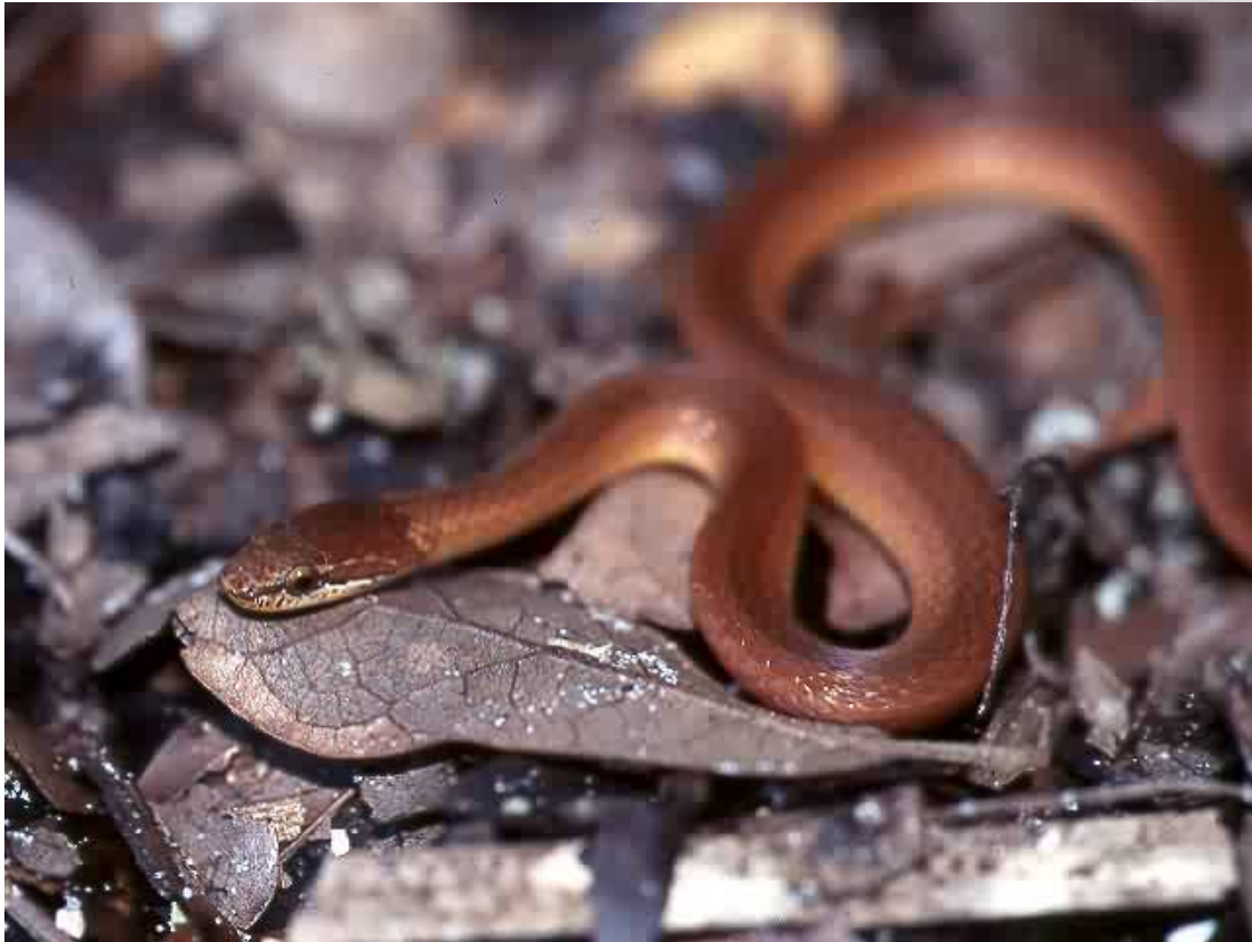
Pine Woods Snake

http://srelherp.uga.edu/snakes/rhafla.htm