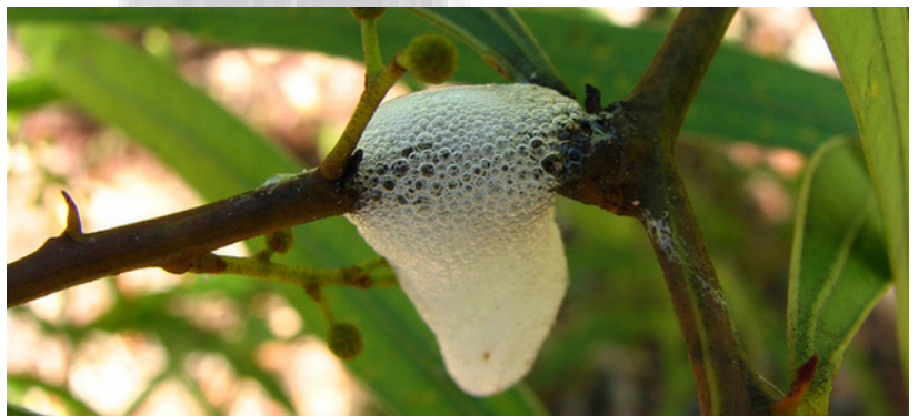
Spittle Bug Juice