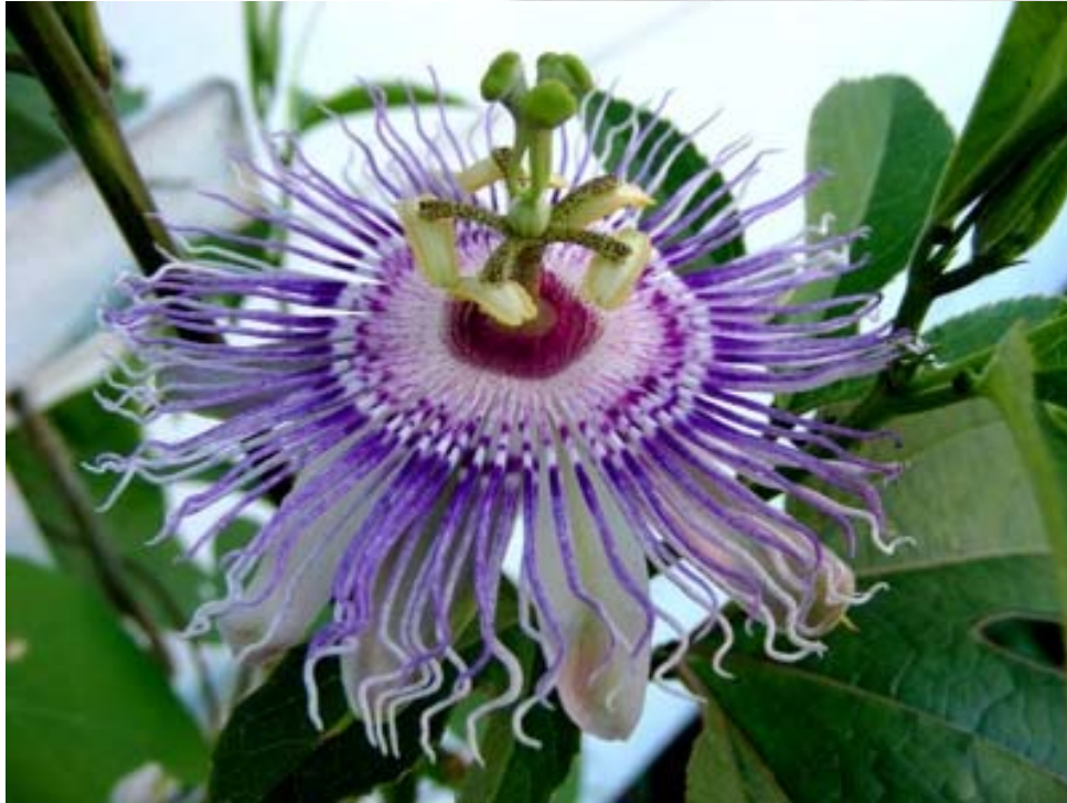
Purple Passion Flower

Bugga da Month: Forest Tent Caterpillar , Malacosoma disstria Hübner