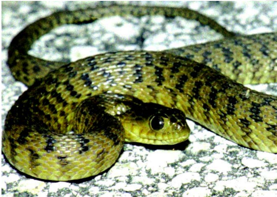
Florida Green Water Snake

https://www.flmnh.ufl.edu/herpetology/fl-guide/nerodiafloridana.htm