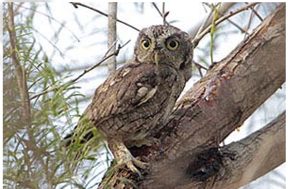
Eastern Screech Owl

The Sky Tells a Story: The full moon, the Green Corn Moon in American Indian tradition, will be on August 10th and thus interfere badly with the peak of the Perseid meteor shower on the mornings of August 12-13th this year. Hercules, the Dragon Slayer, lies overhead tromping over Ophiuchus, the Snake Handler. The brightest star of the northern hemisphere, Vega dominates the NE sky in Lyra the Lyre. Below Vega are the other two bright stars of the Summer Triangle. Deneb is at the top of the Northern Cross, known as