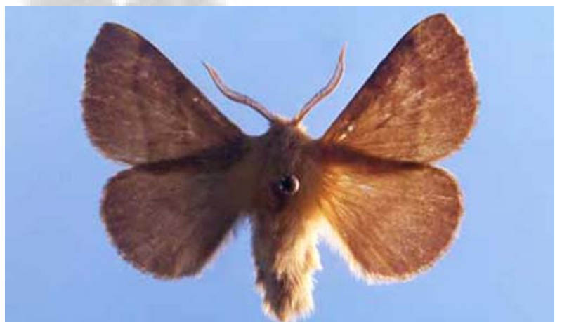
Forest Tent Caterpillar and Moth