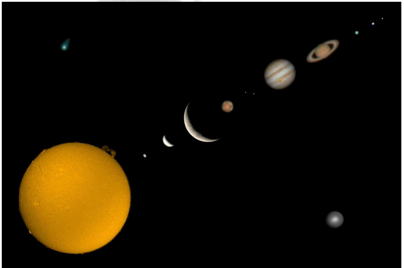
The Solar System

The Sky Tells a Story: My Very Educated Mother Just Showed Us Nine Planets !