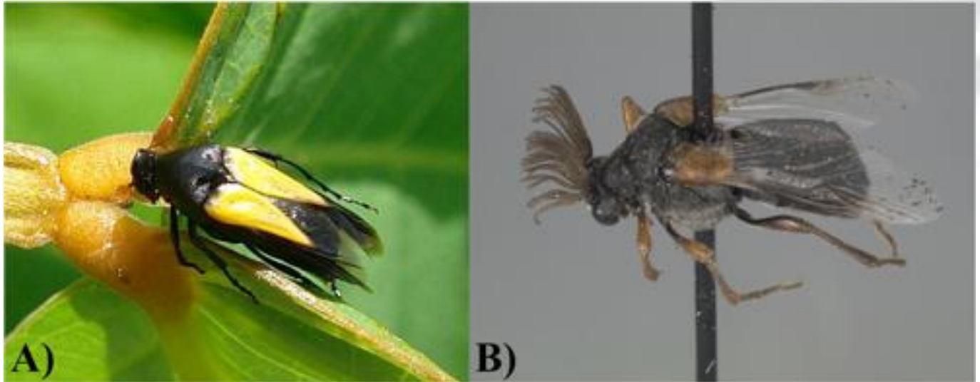
Adult specimens of the two genera of Ripiphoridae. A) Macrosiagon Hentz, and B) Ripiphorus Bosc.

Critter of the Month: Lionfish , Pterois volitans