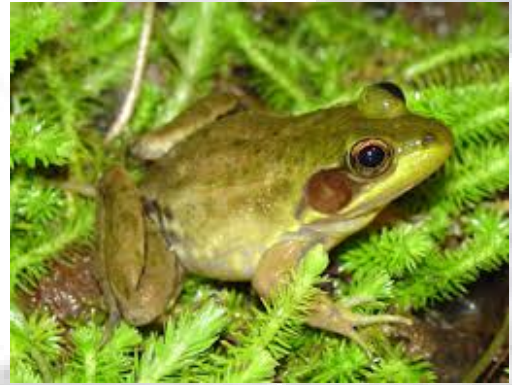
Florida Bog Frog

Everybody's Heard About the Bird: Whooping Crane , Grus americana